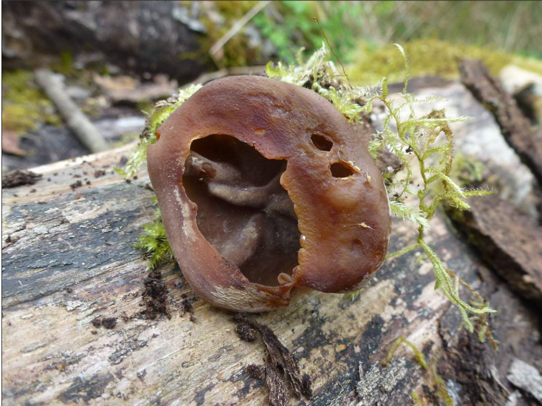
A somewhat atypically squashed specimen of Peziza micropus growing on a log pile today. (PC)

Towards the end of our chosen route one pile of felled deciduous logs supplied us with several easily identifiable species together with one which we guessed at but were uncertain of because its shape was somewhat atypical. This was another Ascomycete cup fungus having a brown round fleshy fruitbody about 5cm across which instead of being 'cup'-shaped was more flattened with the edges rather abruptly inrolled. Was it a species of Peziza or something rather different? A microscope was needed to ascertain whether the long thin sausage-like cells typical of an Ascomycete would stain blue at their tips when viewed in a solution known as Melzer's. If so then this was proof that we had a species of Peziza , if not then it was something different. They did, and it was (which is what we'd suspected all along) and the spores fitted well with Peziza micropus – no common name but not an unusual species to find growing on wood, just a bit unusual to find it growing this shape as if something had sat on it – a gnome perhaps?!