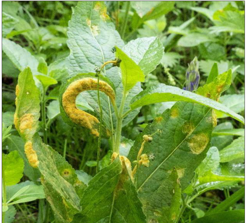
Melampsora populnea at the typical ‘rusty’ stage on Dog’s Mercury today.